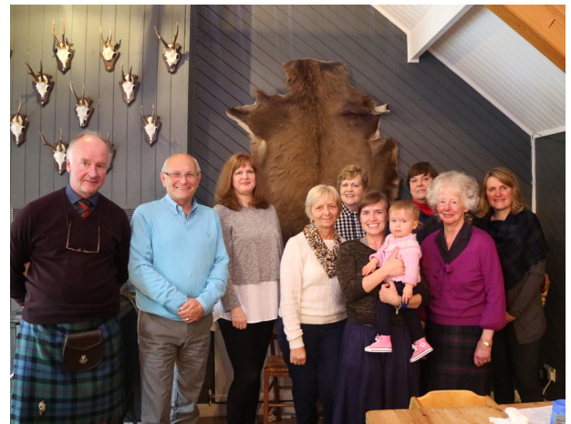
Biennial General Meeting in Scotland, at The Boat Inn, Aboyne, Royal Deeside. This was the first in Scotland for more than 20 years.