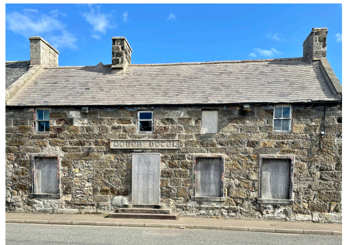
The Dower Hotel and soon to be The Clan Baird Centre